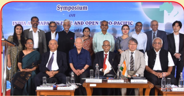
Speakers and a few IJCCI members at the Inaugural Session - 7th May 2022