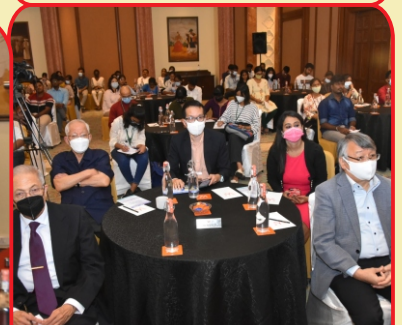
A cross section of the audience 8th May 2022