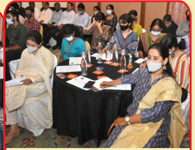
Cross section of the audience 7th May 2022