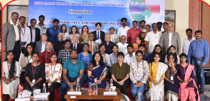
Speakers and Students - 8th May 2022