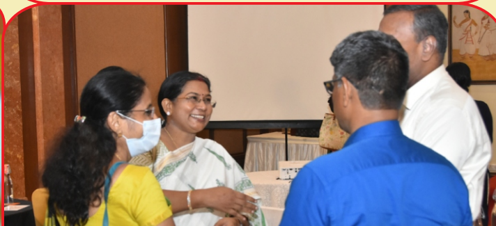
Interaction with Speakers 8th May 2022