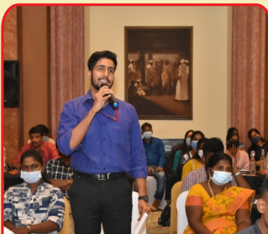
Q & A Session - 8th May 2022