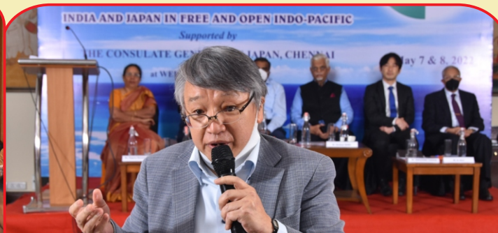
Q & A Session - 8th May 2022