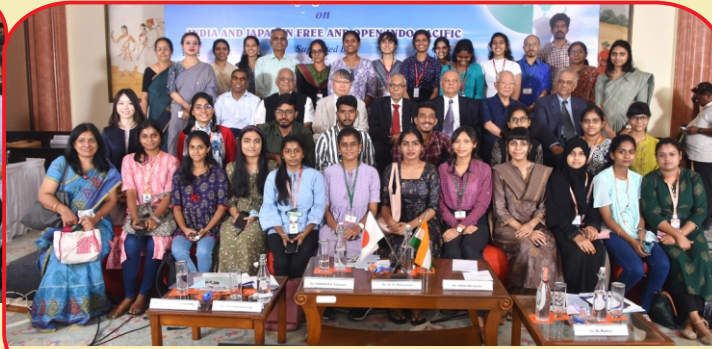
Speakers and Students - 7th May 2022