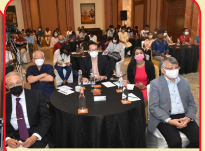
Cross section of the audience 8th May 2022