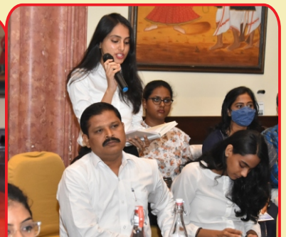
Q & A Session - 8th May 2022