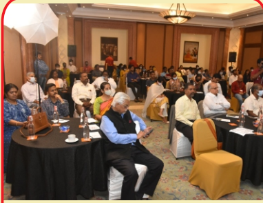
Cross section of the audience 8th May 2022