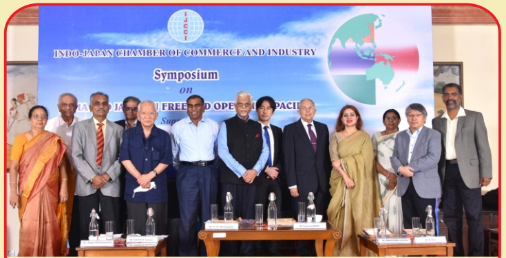
Speakers at the Plenary Sessions - 8th May 2022