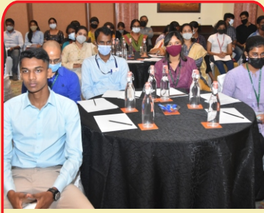
Cross section of the audience 7th May 2022